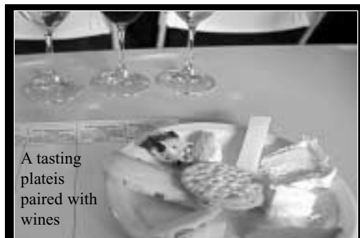
A tasting plate paired with wines

People came from all parts of the state to attend, and the crowds were a testament to the level of inter-